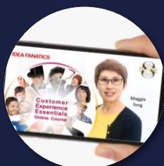
e-Learning Learn Fundamentals