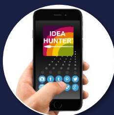
Crowd Ideation Engage Everyone