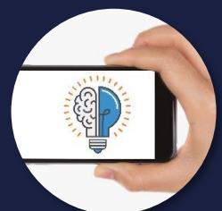
e-Learning Stay Updated