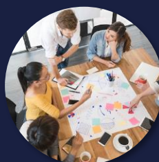
Co-create Workshop Innovate Experience