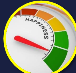
Quantitative Research Measure Results