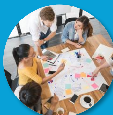
Co-create Workshop Innovate Experience