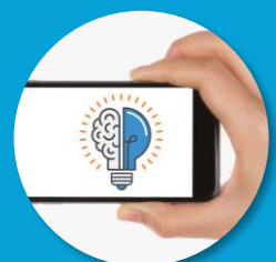
e-Learning Stay Updated