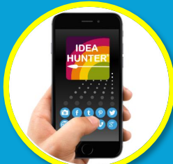
Crowd Ideation Engage Everyone