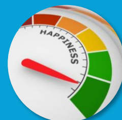
Quantitative Research Measure Results